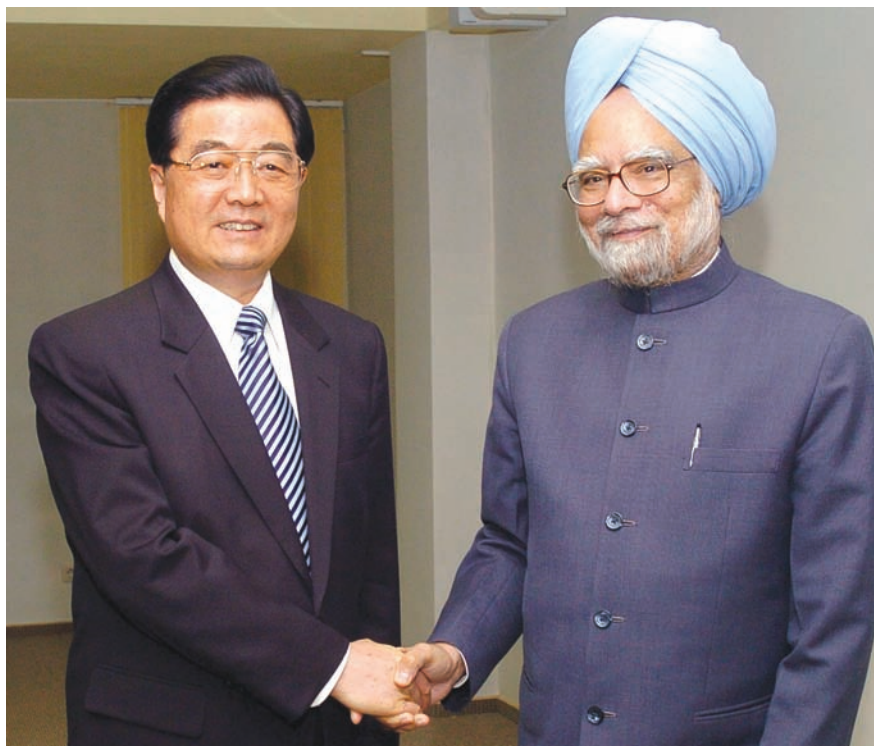
SCRAMBLE TO AID: Unless India develops its own aid architecture the intricate Chinese aid mechanism will be the cause of potent challenges to India, especially in Asia and Africa

in Eastern Europe. Africa and Asia received about 46 per cent and 33 per cent of total Chinese aid respectively.